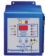
LT-1900 in NEMA 12 (IP 64) steel enclosure.